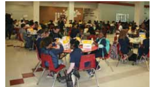
SCES students enjoy a healthy meal before engaging in various activities