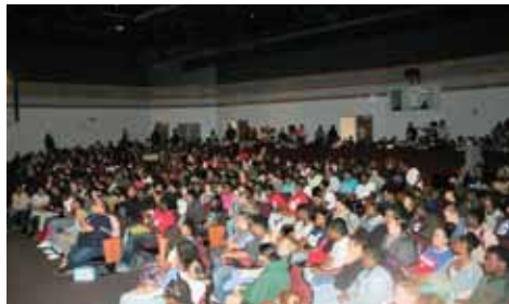
High school students enjoyed the motivational message

A huge component of the event was dedicated to student workshops. The Healthy Relationships session focused on the basics of practical skills to help build and maintain strong, healthy individual and family relationships. The Law Enforcement workshop combined the importance of good decision-making skills as well as the promotion of positive interaction with law enforcement.