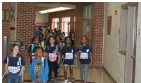
We are so ready to have fun!