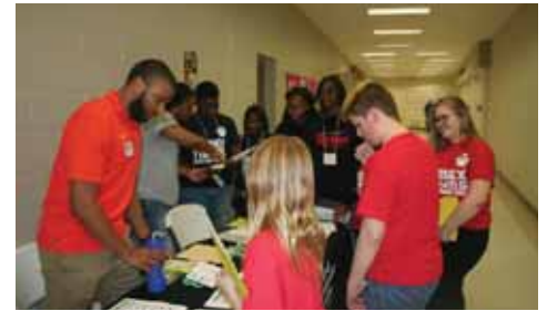
Students learn important information from vendors