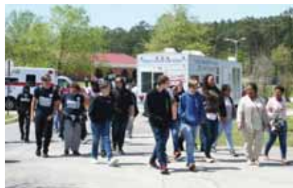
On our way to have a good time!

At first glance, the event that unfolded at Sussex Central High School on the warm, sunny afternoon of April 17th was just another after-school event, with food, music and local community organizations advertising their programs. The 2nd Annual Sussex County Public School (SCPS) Youth Summit and Health Fair was so much more. The event was organized by the School Division's Student Services Department as part of its effort to not only organize more activities for local youth but to get them more involved in their communities and to address direct concerns that students cope with daily.