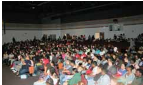
High school students enjoyed the motivational message

cyber-bullying. Parent sessions included topics that addressed finances, technology, employment skills, and information pertaining to their child's education and school environment.