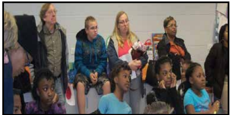
Parents and students listen to a presentation during a session at the Reading and Writing SOL Night.