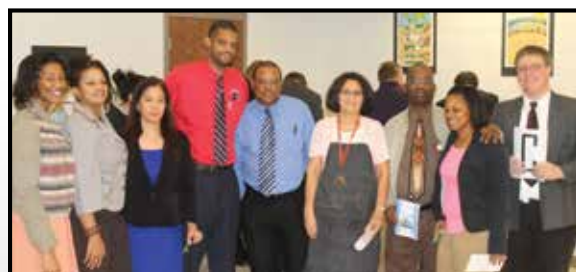
Members of the SCHS/SCMS Administration, along with SCHS Science teachers and students.