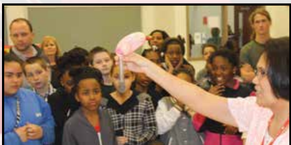
SCES students are intrigued by the experiments and demonstrations at the Science Fair.