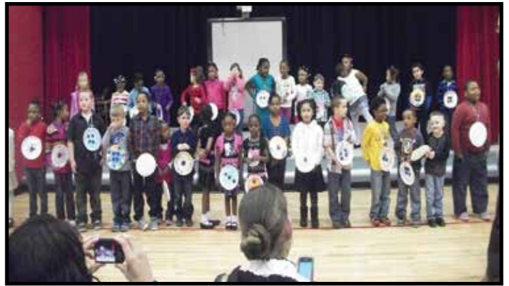
Students entertain parents by reciting lyrics to a song.

Community partners teamed up with Sussex Central Elementary School to provide door prizes for parents. The Parents Teachers and Partners in Education (P.T.P.E) provided refreshments for all participants attending the school events. SOL Nights have served as an inspiring way to provide parents the opportunity for a glance into their child's school day. ■