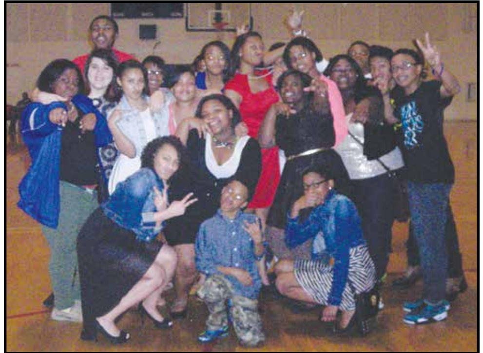
Eighth Grade Memories