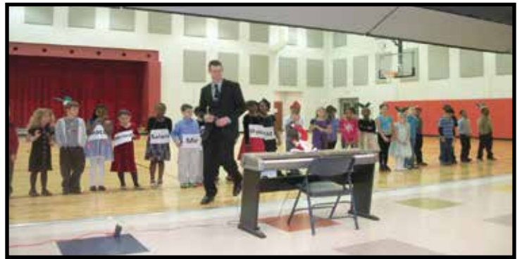
Students are ready to showcase their singing talents to their parents.