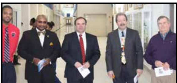
SCPS administration and board members attend the science fair.

On the next day, the science department sponsored a trip to the Richmond Science Museum where they conducted many experiments and science observations. ■