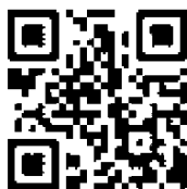
Example of QR Code