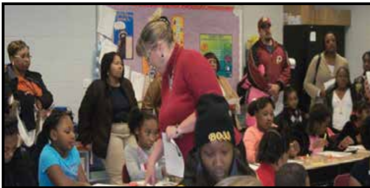
Teacher engages students in Reading and Writing activities.