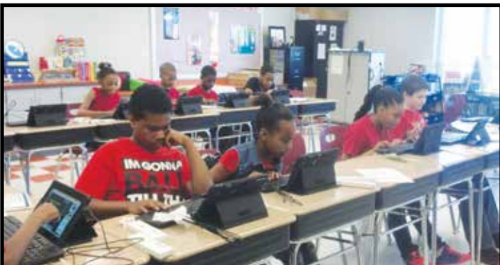
Sussex Central Elementary School students using TestNav to practice for their upcoming Writing SOL.